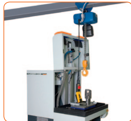
It also allows larger components to be positioned into the unit using a crane, because the cabinet opens upwards.